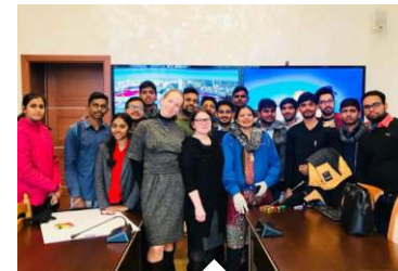
Republican Institute for Vocational Education, RIPO, Belarus