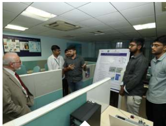
Pennsylvania State, USA