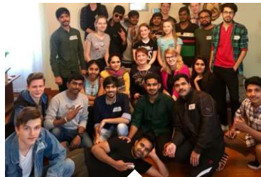
University of Alabama, USA