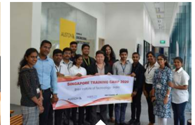
Auston Institute of Management, Singapore