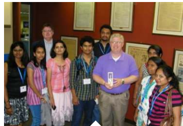
University of Alabama, USA